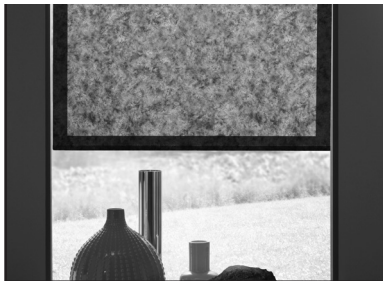
Border - Picture Frame

This space allows you to note information that is pertinent to your shade order. Indicate in Special Instructions for items like Hold Downs, Spacer Blocks and Extension Brackets etc. To order motorized roller shades, contact Comfortex Customer Service or order online Direct Connect online ordering.