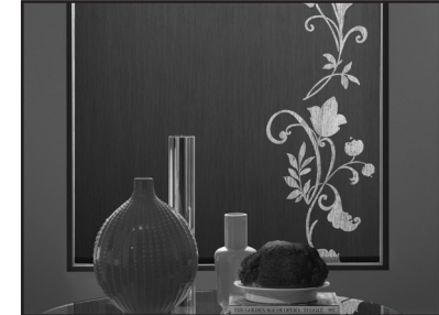
Decorative Border Pattern