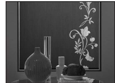
Decorative Border Pattern