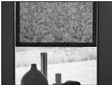
Border - Picture Frame

This space allows you to note information that is pertinent to your shade order. Indicate in Special Instructions for items like Hold Downs, Spacer Blocks and Extension Brackets etc. To order motorized roman shades, contact Comfortex Customer Service or order online Direct Connect online ordering.